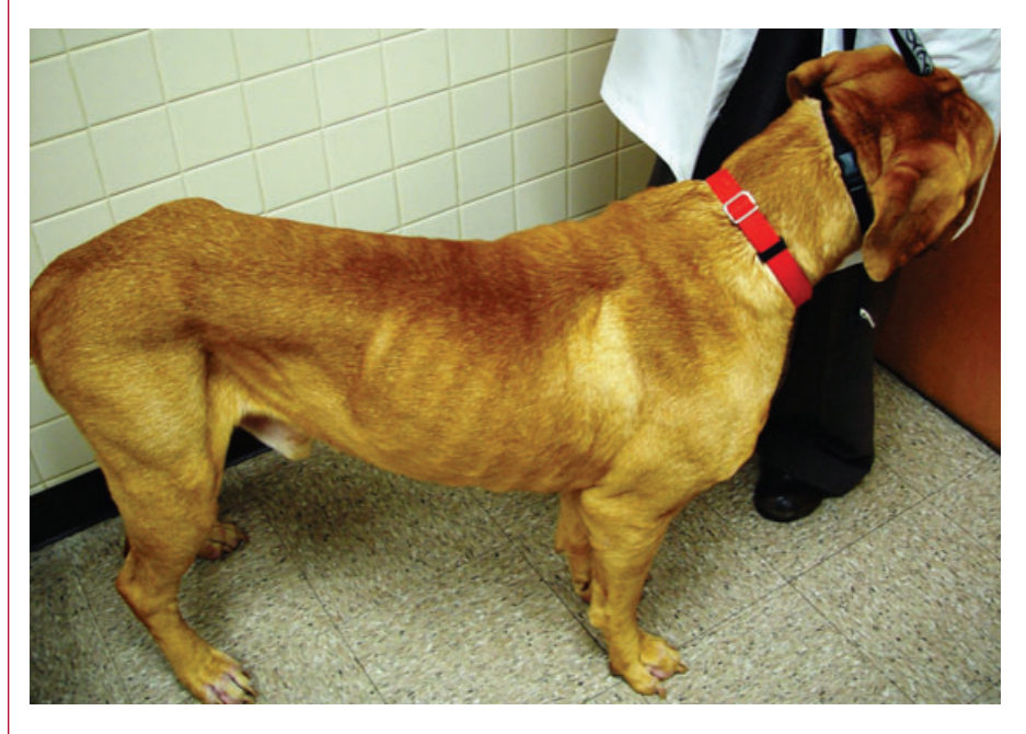
FIG 3. A dog with severe heart failure and cardiac cachexia. Careful attention to monitoring bodyweight and muscle condition allows the clinician to detect cachexia at an earlier and more subtle stage, when interventions such as omega-3 fatty acids are more likely to be beneficial

Cardiac cachexia is a loss of lean body mass that occurs in heart failure (Fig 3; (Freeman and Roubenoff 1994, Freeman and others 1998, von Haehling and others 2009). Cachexia has important detrimental effects in the cardiac patient and is an independent risk factor for mortality in people with heart failure (Anker and others 1997b, Anker and others 2003).